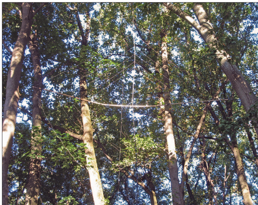
This stealthy nested loop is almost invisible among the trees.

Calculate the perimeter size, P , of each loop by dividing the frequency in MHz into 1005 feet. Table 1 shows the loop dimensions. Start with the 20 meter loop, the largest loop. Cut a 70.90 foot segment of wire for the loop perimeter length, P . Divide the perimeter length by 4 to determine the length, S , of each side. The PVC pipe horizontal cross support spans between opposite loop corners, and is 1.41 times the largest loop side length, S . We used brass screws to hold the PVC together. Lay your antenna wire out on the structure, temporarily taping it to find where the wire should pass through the PVC pipe. Drill